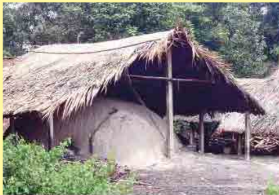
A general view of a charcoal factory in Dong Nai.